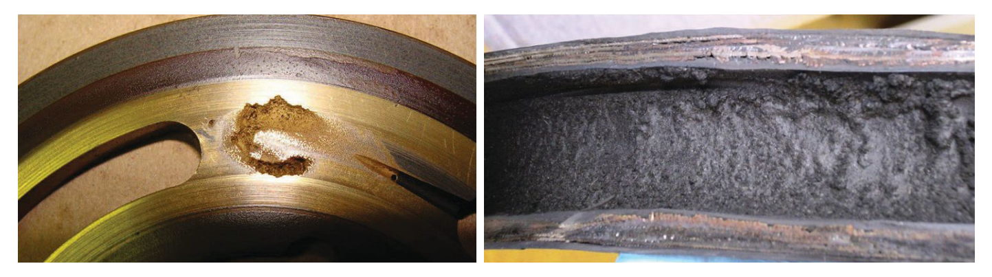
Cavitation wear and microdieseling damage.

same concepts to hydraulic oils, but the two types of systems really should be looked at separately.